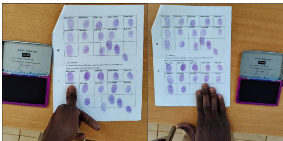
Figure 1: Fingerprints being obtained using Indian ink staining method

In this study, of the total 300 respondents enrolled; 150 were diabetic (cases) while 150 were non-diabetics (controls), out of which 33.33% (100) were aged 60 years and above while the lowest age set was 20-30 years at 6.0% (9). 96.67% (290) of the total respondents were Christians while 3.33% (10) were Muslims. 49.67% (149) had a family history of diabetes while 50.33% (151) had no family history. In terms of sex, females were the majority at 60.67% (182) as compared to males at 39.33% (118).