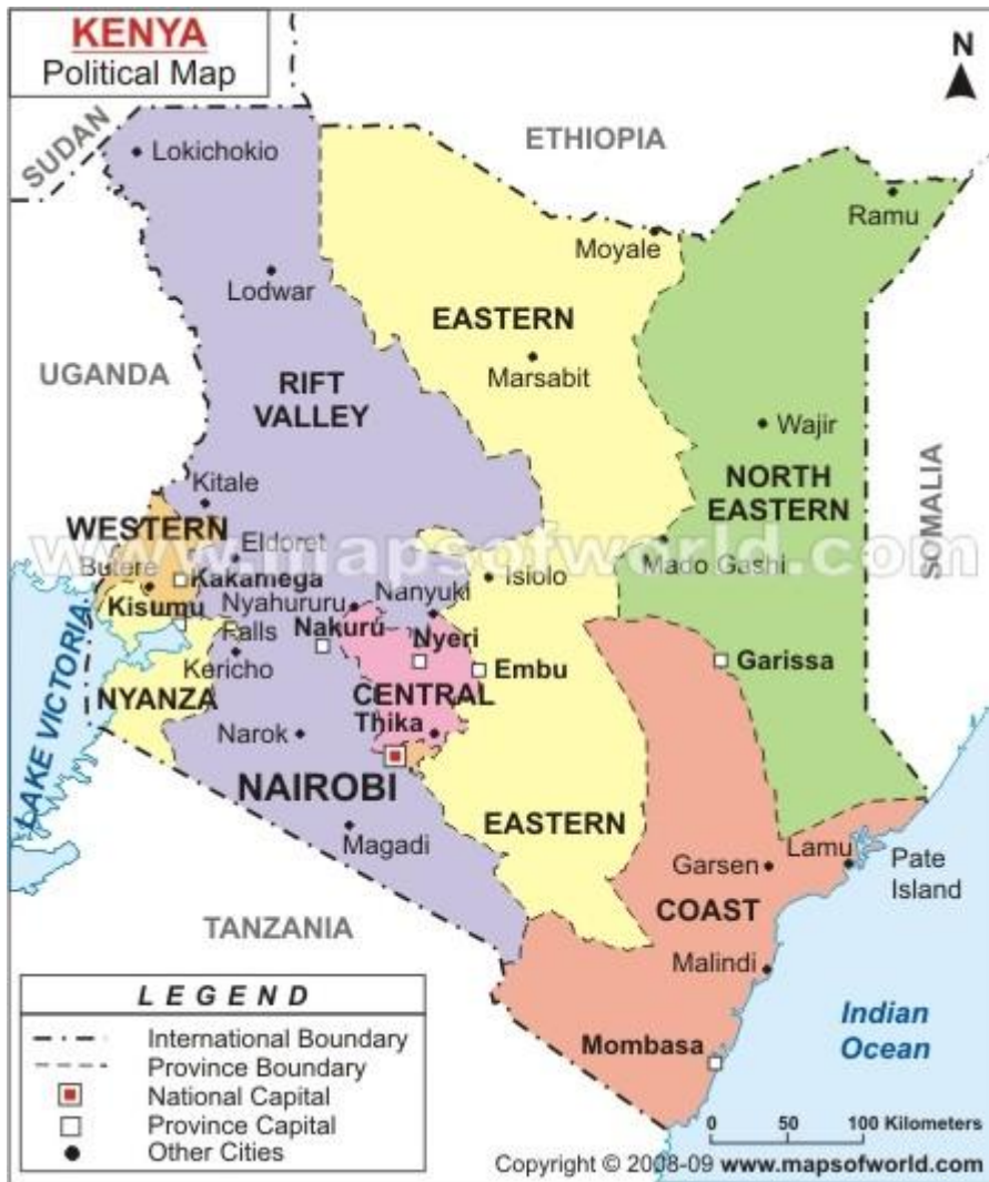
Figure 3.1: Map of Kenya, Kisumu County